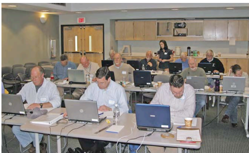
Municipal shellfish commission members learn the basics of desktop GIS at a workshop offered at the University of Connecticut.